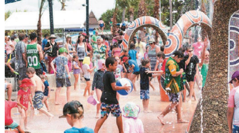
Keppel Kracken zero depth water park