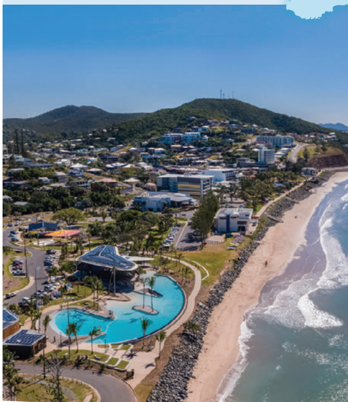
Yeppoon, looking North

MARINE: Keppel Bay Marina offers a safe all-weather harbour, with wide channels and up to 500 widely spaced floating berths. Keppel Bay Marina is the gateway to the 17 magnificent Keppel Islands, catering for vessels up to 35 metres in length. The marina also has access to bus connections to Yeppoon and Rockhampton, including the airport and Traveltrain station.