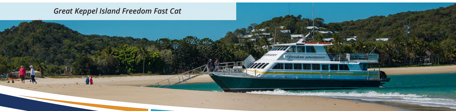
Great Keppel Island Freedom Fast Cat