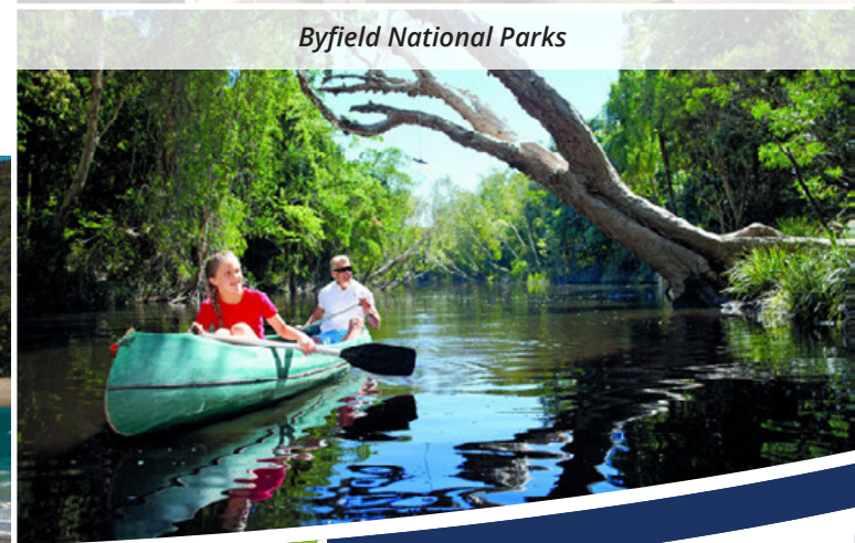
Byfield National Parks