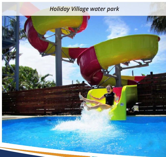
Holiday Village water park