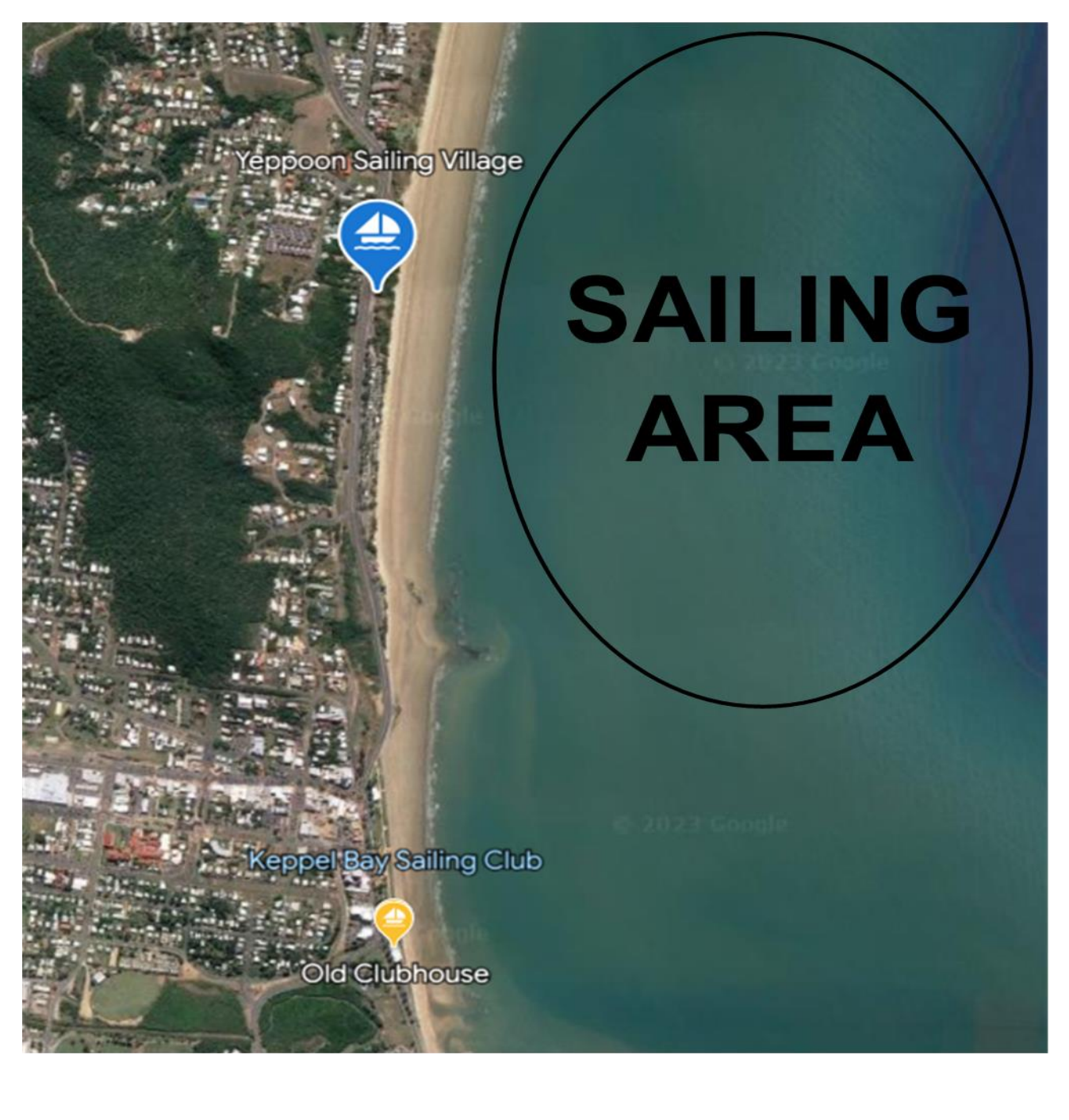
Illustration A (RACING AREA Keppel Bay Sailing Club)