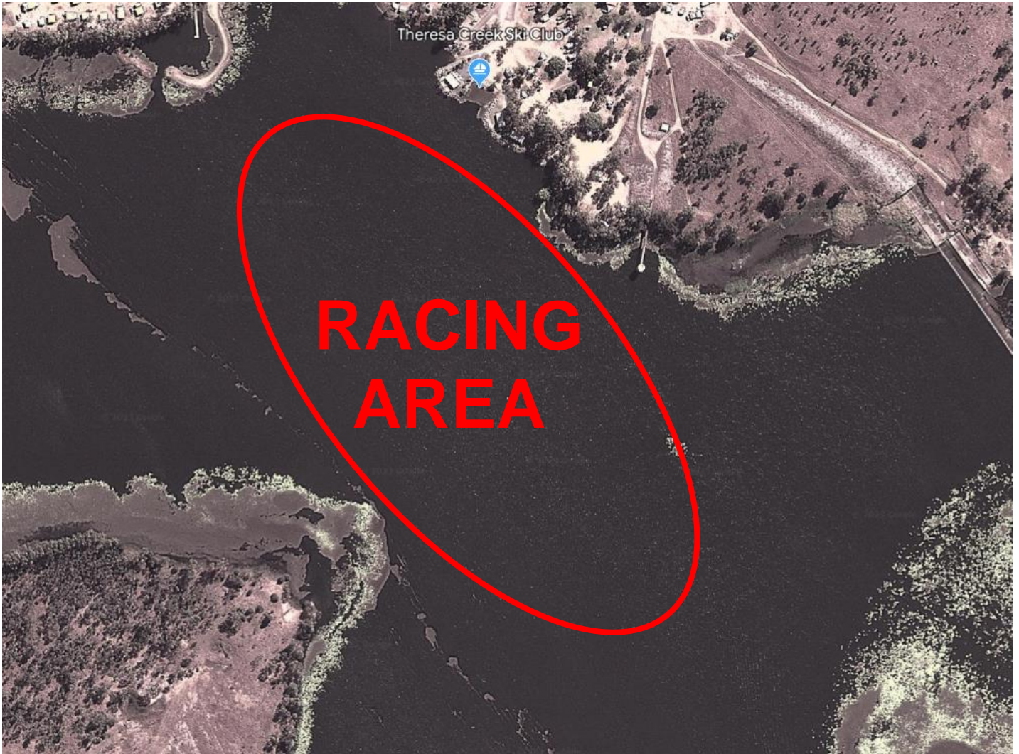
ILLUSTRATION B – Racing Area

Prizes will be awarded to the boats finishing 1st, 2nd and 3rd in each division for the regatta. Other prizes may be awarded at the discretion of the Race Committee.